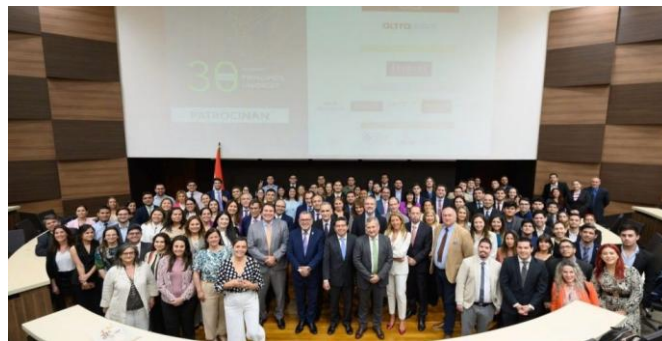
October 2024, Central Bank of Paraguay, Asunción (Paraguay)