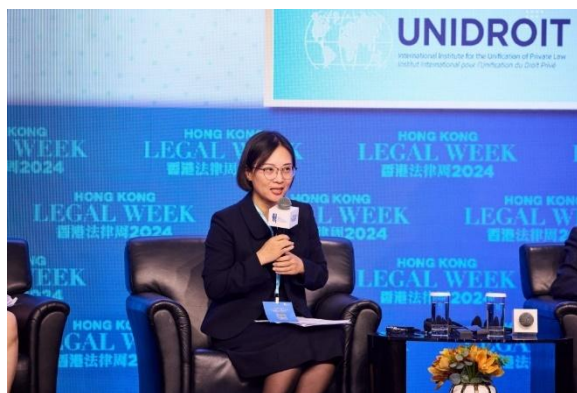
November 2024, Hong Kong Legal Week, Hong Kong (HKSAR)

Paraguay: On 14 and 15 October 2024, the Central Bank of Paraguay hosted the two-day Latin American Congress to celebrate the 30 th anniversary of the UPICC organised by the Centro de Estudios de Derecho, Economía y Política (CEDEP) (see Section II.B.3.a, below). The Secretary-General travelled to Asunción for the occasion and had the opportunity to meet with the Minister of Foreign Affairs and also attend a meeting with Judges from the Supreme Court.