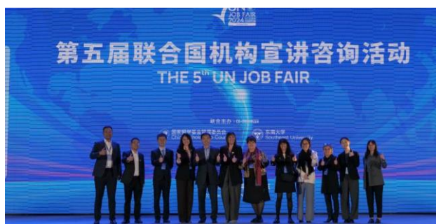
October 2024, UNIDROIT at the fifth edition of the UN Job Fair, Nanjing (People’s Republic of China)