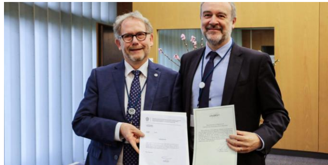
8 March 2024, first and constituent session of the Supervisory Authority, Bern (Switzerland)

On 8 March 2024, the first and constituent session of the Supervisory Authority took place in Bern. After a welcome by the Secretaries General of OTIF and UNIDROIT, a ceremony took place for the formal handover of the certificate from OTIF to UNIDROIT confirming the operability of the International Registry for Railway Rolling Stock and thus officially marking the entry into force of the Luxembourg Rail Protocol.