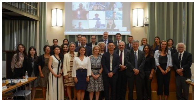
September 2024, Working Group on the Legal Nature of VCCs, UNIDROIT, Rome (Italy)

The second session of the Working Group on the Legal Nature of Verified Carbon Credits (VCCs) took place at the seat of UNIDROIT and remotely from 22 to 24 April 2024. In its second session, the Working Group considered the proposed structure and content of the future instrument, analysed the main steps in the life cycle of a VCC through a property law perspective, and discussed the definitions of key terms to be included in the instrument. Of particular relevance was consideration of the role played by independent carbon crediting programmes and registries, including in relation to the issuance and registration of VCCs. The Working Group session included presentations from representatives from independent carbon crediting programmes, addressing, among other things, how VCCs are issued, evidenced, individualised, transferred, encumbered, retired or otherwise cancelled.