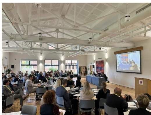
September 2024, 13 th annual Cape Town Convention Academic Project Conference, University of Cambridge, Cambridge (United Kingdom)

The Cape Town Convention Academic Project is a partnership between UNIDROIT and the University of Cambridge Faculty of Law, under the auspices of the Centre for Corporate and Commercial Law (3CL). The Aviation Working Group is the founding sponsor of the project.