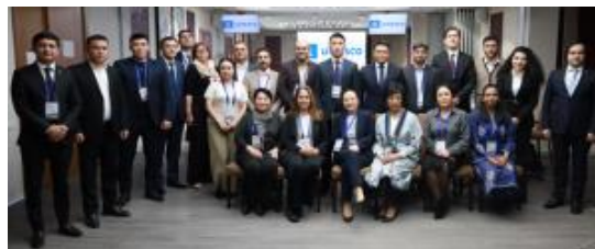
30 October - 1 November 2024, UNESCO workshop on "Fighting the illicit trafficking of cultural property in Central Asia", Almaty (Kazakhstan)