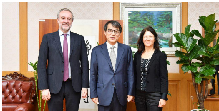
31 October 2024, UNIDROIT visit to the Supreme Court of Korea, Seoul (Republic of Korea)