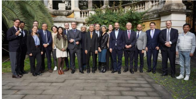
November 2024, Working Group on UPICC and IICs, UNIDROIT, Rome (Italy)

of the various Subgroups that had been established after the first session. The Working Group discussed, inter alia , pre-contractual issues relating to IICs, validity, change of circumstances, policy goals (e.g., ESG obligations), choice of law, and dispute settlement clauses, along with a preliminary draft structure for the future soft-law instrument.