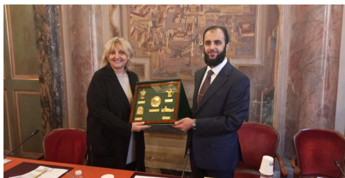
25 January 2024, visit from a delegation of the Ministry of Justice of the Kingdom of Saudi Arabia, UNIDROIT, Rome (Italy)

On 22 October 2024, the third Italian Water Dialogue, in the framework of the " Festival della Diplomazia ", was hosted at UNIDROIT, bringing together ministers, delegates and prominent figures in the water field to discuss development strategies for the Italian water supply chain. The joint work of UNIDROIT, FAO and IFAD on Private Law and Agriculture and its implications for water use and sustainable development were presented.