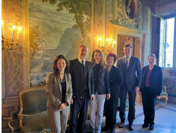
21 February 2024, visit from Latvia delegation, UNIDROIT, Rome (Italy)