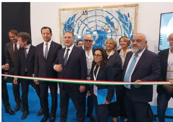
15 May 2024, Cooperation Development Expo ("Codeway"), Rome (Italy)