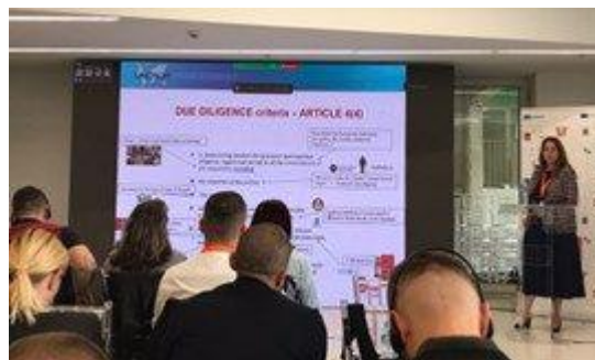
October 2024, EU-UNESCO workshop within the project "Fighting against the illicit trafficking of cultural property in the Western Balkans", Tirana (Albania)