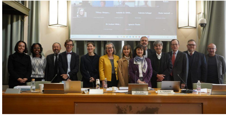
November 2024, CLSAE Working Group, UNIDROIT, Rome (Italy)

The CLSAE Working Group held its sixth session from 20 to 22 November 2024, in which it considered updated drafts of the discussion papers from the various Subgroups. Following the meeting, the Subgroups would continue to refine these papers based on the recommendations received. The next session of the Working Group was scheduled for 9 to 11 April 2025.