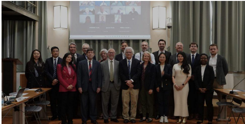
April 2024, MLF GtE Working Group session, UNIDROIT, Rome (Italy)

The development of the Model Law on Factoring (MLF) was approved by the UNIDROIT General Assembly at its 78 th session in December 2019 as a high-priority project for the 2020-2022 Triennial Work Programme. Work commenced on the project in 2020. Subsequently, the development of a Guide to Enactment (GtE) of the MLF was approved as a high-priority project on the UNIDROIT Work Programme for 2023–2025, as adopted by the UNIDROIT Governing Council at its 101 st session in June 2022 and the UNIDROIT General Assembly at its 81 st session in December 2022. Following the adoption of the MLF by the Governing Council at its 102 nd session in May 2023, UNIDROIT began work on the GtE, convening the same expert Working Group that had developed the MLF, chaired by UNIDROIT Governing Council Member ad honorem Prof. Henry Gabriel.