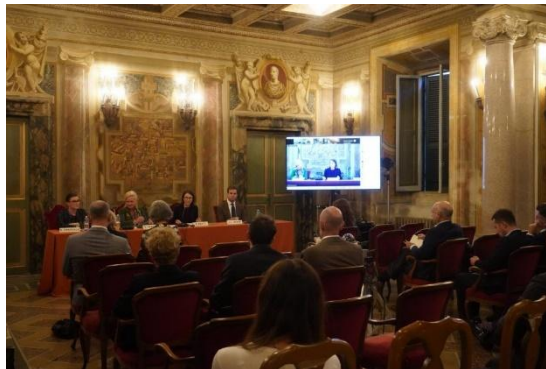
11 October 2024, workshop hosted by NLC, UNIDROIT, Rome (Italy)

The UNIDROIT Centre for Nordic Law Studies and Transnational Private Law (“Nordic Law Centre”, NLC) is a research centre which fosters cooperation between the Northern European jurisdictions and UNIDROIT in the field of private law. The Centre was founded in May 2023 and is hosted with the participation of institutions from Denmark, Finland, Iceland, Norway, and Sweden. The UNIDROIT Nordic Law Centre seeks to increase international awareness of Nordic law and enhance the dissemination and knowledge of UNIDROIT’s work in the Nordic region.