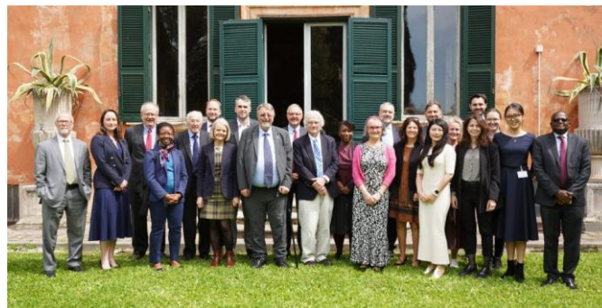
11 April 2024, sixth session of the MAC Preparatory Commission, UNIDROIT, Rome (Italy)

Pursuant to Resolution 1 of the Diplomatic Conference, a Preparatory Commission was established to act as Provisional Supervisory Authority until the Protocol enters into force. The Preparatory Commission operates under the guidance of the Governing Council and the General Assembly of UNIDROIT.