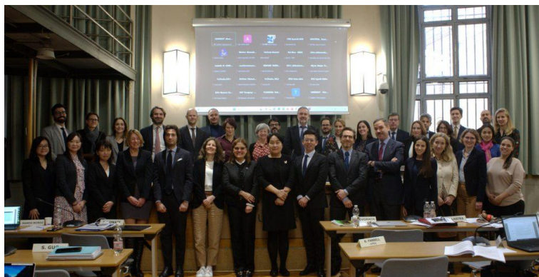
November 2024, Working Group on Bank Insolvency, UNIDROIT, Rome (Italy)

The Working Group on Bank Insolvency held its sixth session from 4 to 6 March 2024. The meeting was attended by 15 individual experts and over 60 representatives of the Working Group's institutional observers, which include over 40 international and regional organisations, as well as banking supervisors, deposit insurers, and bank resolution authorities from all over the world. The main object of discussion during the sixth session was the Draft Legislative Guide on Bank Liquidation that had been updated and further developed by the Drafting Committee following the Working Group's fifth session in October 2023. The Working Group also discussed written comments that Working Group participants had submitted to the Secretariat prior to the sixth session in the context of a consultation of the Draft Guide within the Working Group. The Drafting Committee then met on 6 and 7 March 2024 to address the main feedback received during the sixth Working Group session.