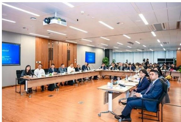
10 November 2024, Symposium on Warehouse Receipt Legislation, Shanghai (People's Republic of China)

Furthermore, the MLWR was presented to African legal experts at a dedicated session during the UNIDROIT International Programme for Law and Development on 21 June 2024.