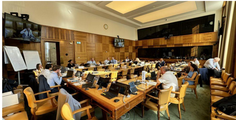
September 2024, second session of the Revisions Committee to the Model Rules on the Permanent Identification of Railway Rolling Stock, UNECE, Geneva (Switzerland)