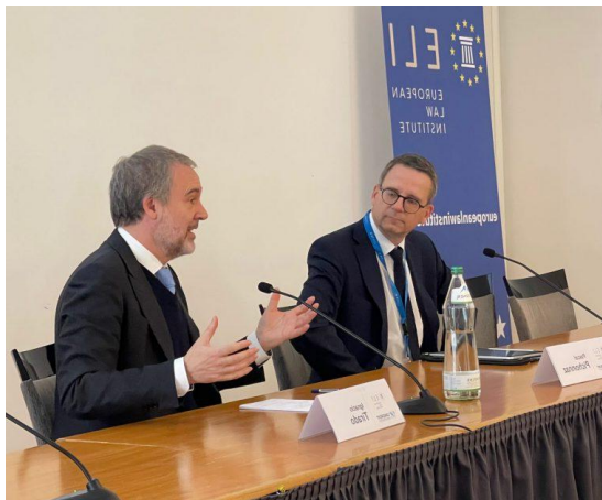
February 2024, Austrian Academy of Sciences, Vienna (Austria)

The ELI-UNIDROIT Model European Rules of Civil Procedure, adopted by the two organisations in 2020, were presented and discussed on various occasions during 2024. Most prominently, on 5 and 6 February 2024, the Model Rules were the subject of a dissemination conference jointly sponsored