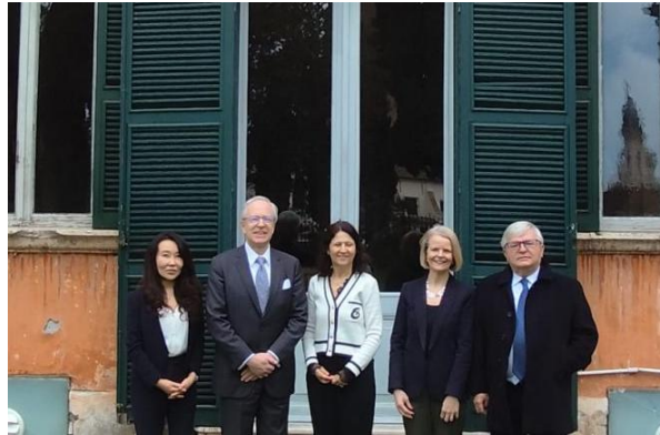
25 March 2024, visit from ADB delegation, UNIDROIT, Rome (Italy)