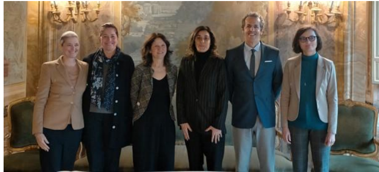
26 March 2024, visit from ICCROM Director-General, UNIDROIT, Rome (Italy)