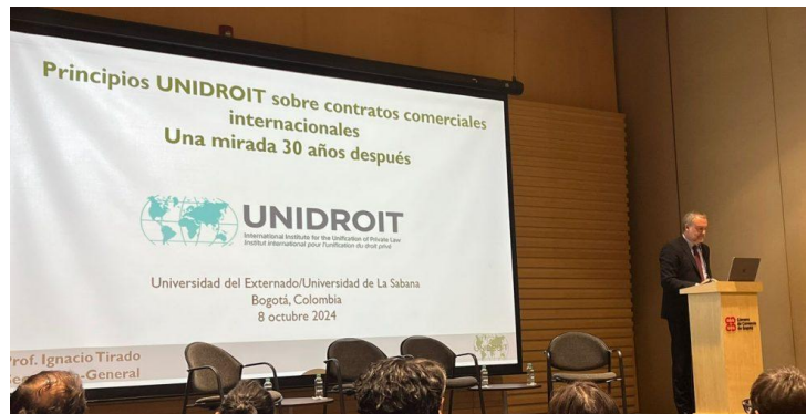
8 October 2024, Chamber of Commerce of Bogotá (Colombia)