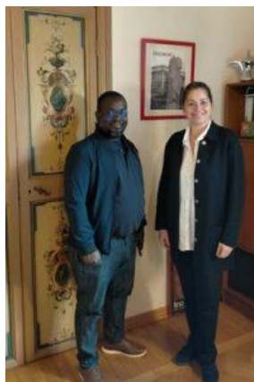
11 April 2024, visit of the EPA Director, UNIDROIT, Rome (Italy)