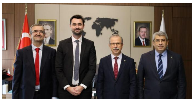
22 November 2024, Medeniyet University, Istanbul (Türkiye)