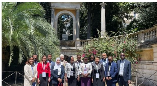
June 2024, IPLD, UNIDROIT, Rome (Italy)

Thanks to the financial support of the Italian Ministry of Foreign Affairs and International Cooperation’s Directorate General for Development and Cooperation (DGCS-MAECI), the third edition of the UNIDROIT International Programme for Law and Development (IPLD), which had been formerly known as the UNIDROIT International Summer School, took place in June and July 2024. The initiative aims to raise awareness about UNIDROIT instruments and activities and encourage knowledge-sharing between different legal cultures, ultimately promoting peaceful relations among States and communities; on this occasion, for the third time, the IPLD’s focus was on the African region.