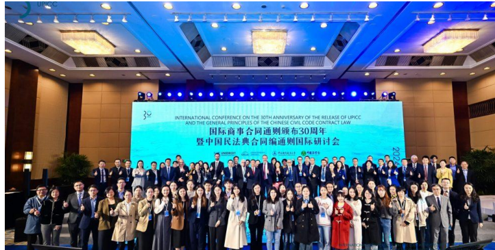
11 November 2024, "The 30 th Anniversary of the Release of the UPICC and the General Principles of the Chinese Civil Code's Contract Law" conference, Shanghai (People's Republic of China)