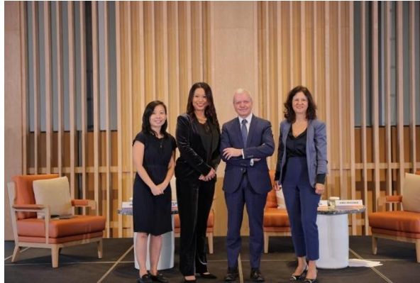
10 October 2024, UNIDROIT at the 23 rd ASEAN Senior Legal Officers' meeting, Singapore